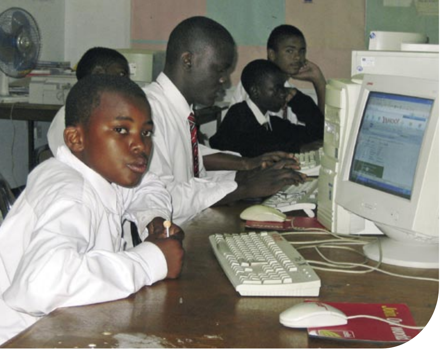
The project was set up as a pilot project with seven schools. It was organised around the Mpelembe Secondary School, which coordinated the project.

rainy season (December–March). Moreover, for the rest of the year internet connectivity was also unreliable. This had serious consequences for the project: the implementation of the project was delayed and the products which had been developed were used much later than planned.