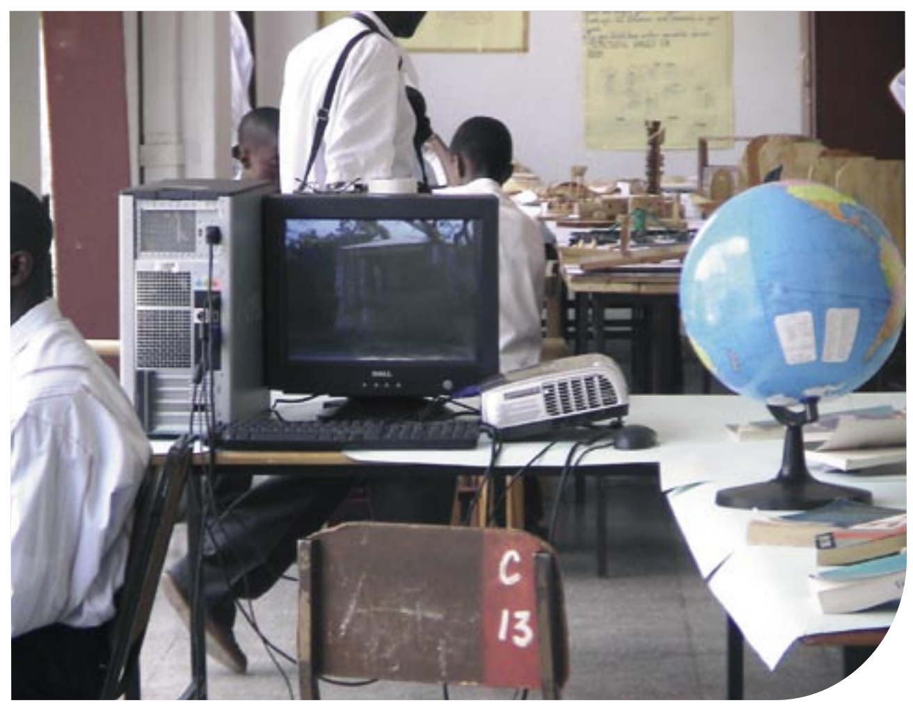
The main focus of the project was to build the capacity of the teachers of the participating schools.

that the ENEDCO project was primarily for other schools and it cost the project team a lot of time and effort to rectify this assumption.