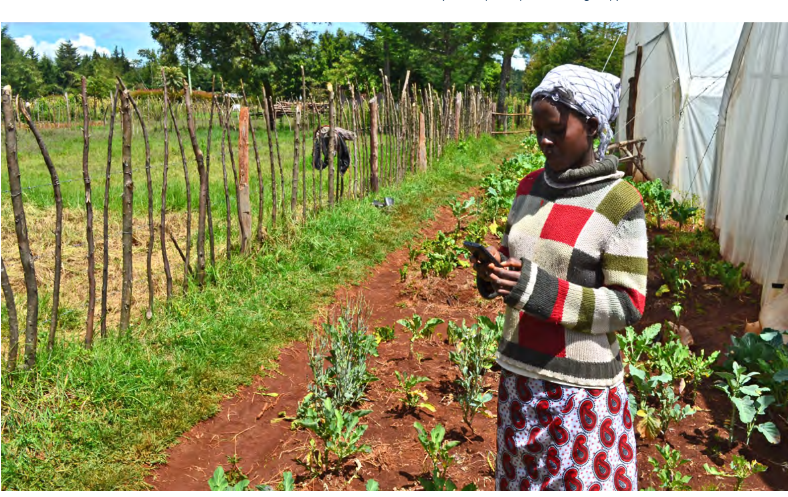
8: Where dependable and proven services exist locally, Connect4Change established linkages and capacity building support to both the NGOs as well as their farmer groups to be able to understand the service's potential and the develop the skills required to make informed use of the available services. For more information on M-Farm, see http://www.mfarm.co.ke

their limited access to information. "I have used the phone to benefit from M-Farm, Before I used to plant onions and the brokers would come and exploit me with low prices. But now when they come I ask them where they come from and I simply send an SMS and confirm the price of the onions in the area where they come from. For example, if in Kisumu one kilogramme of onion is kshs 50 and the broker wants to give you kshs 20, I will tell him or her the right price and we will bargain based on that" (female participant in focus group). Through being better informed and having access to various information channels, women were able to generate income, pay school fees, and improve food security in the household, as reflected in the statement by a female participant of a focus group discussion: "I just used to eat sukuma wiki (Kale). I used to plant onion in small scale only for subsistence but now I plant them in large scale for sale (Agribusiness) through ICT. So when I get the money, I use some to pay school fees, some for preparing the farm and the rest I use to buy good food in the house. I also used to plant onions only but through the videos I watched in Cheptais I learnt about intercropping and now in the same farm I try to mix planting coffee, bananas, vegetables and beans" (female participant, focus group).