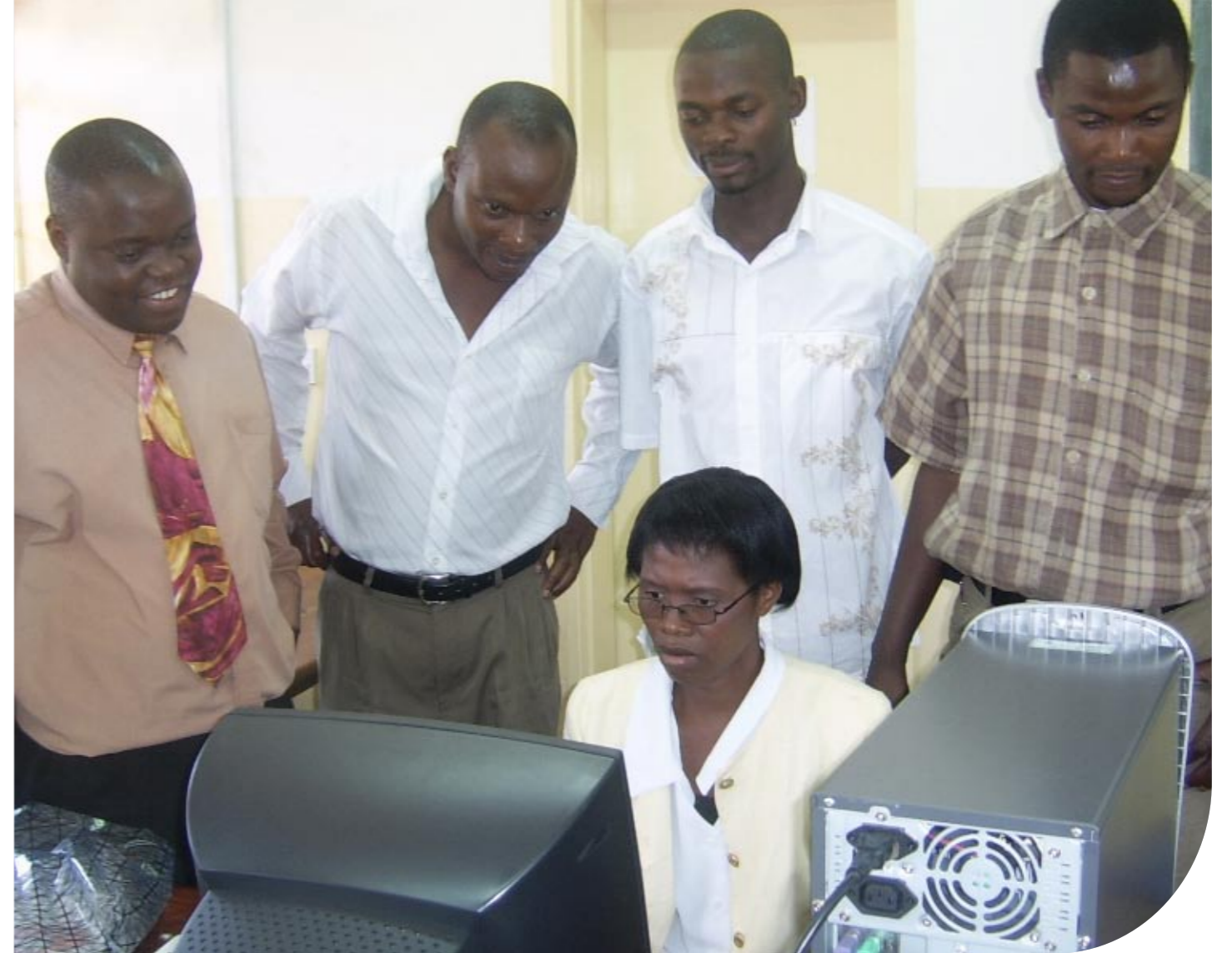
Teachers are trained in ICT skills.

majority were teachers (18), 2 were managers, 4 were support staff and the remaining 5 were One World Africa staff. Eight (8) live in rural areas, 11 in a provincial town and 10 live in Lusaka. All of them have tertiary education. Most of the teachers (59%) were unable to access ICT on a daily basis, while 31% only had monthly access or less. According to a teacher at St Paul's school in Kabwe: "The internet provider in the neighbourhood does not provide a very good service, but there is no alternative." Another teacher mentioned that "if the connectivity at school does not work it is far to the nearest internet café, which is about 30 km away."