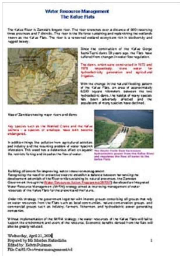
Example of a geography note, created by teachers who are trained in ICT use.