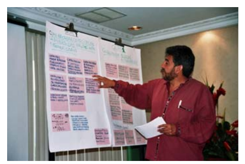
Group discussion, Ecuador

The second step was to define how to measure impact at this level. IICD formulated five indicators: awareness, empowerment, economic impact, negative impact and organisational impact. Each indicator is made up of several elements. For instance, empowerment consists of skills, self-confidence and influence on decisionmaking. End-users can give feedback by responding to questions or statements in a survey such as: "Through this project I have gained more self-confidence". Together, these indicators can give a good impression of the impact of IICD's programmes in health, governance education. and livelihoods.