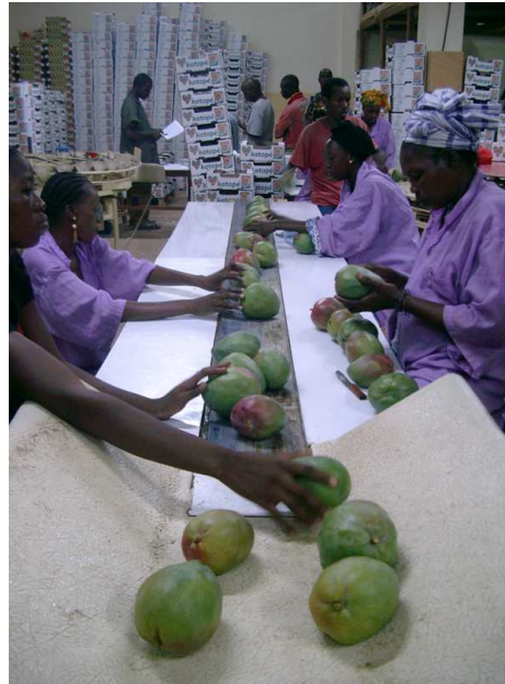
Mango production facility. Mali.

In line with all IICD's sector programmes, at project level, emphasis is focused on three key goals. Firstly, improving the competence of the producer: in this case the farmer. In practice this means, for example, reducing