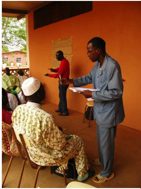
Focus group meeting for the two farmers unions of Sene Kunafoni Bulon and Jèkafo Guèlèkan. Mali.

Mali is currently undergoing a major reorientation in the roles of the state and the other actors in agriculture. The recently adopted Loi d'Orientation Agricole is reflecting this new dynamic.