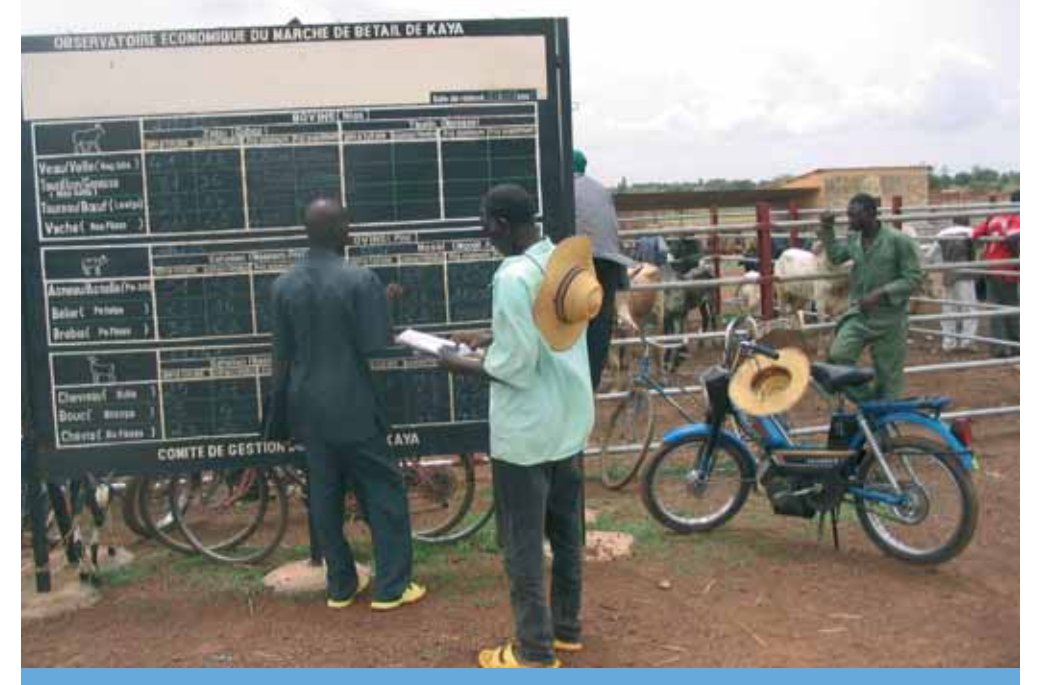
Pricing up for the cattle market, Kaya, Burkina Faso