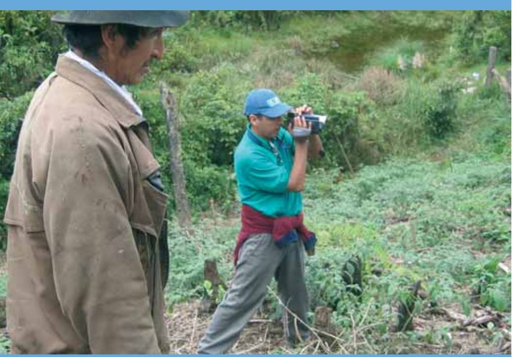
umenting the AGRECOL project. Chapare. Bolivia