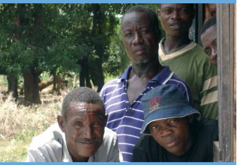
armers working with the SEND foundation, Salaga, Ghana