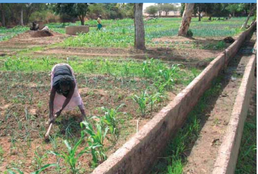
Tending to crops, Seguedin, Burkina Faso

In this programme, information on prices, availability, etc. is gathered at the farm level through hand-held computer devices, and the information is centralised in a national database. The information is then made available through a web portal and compiled into printed reports customised for each target group.