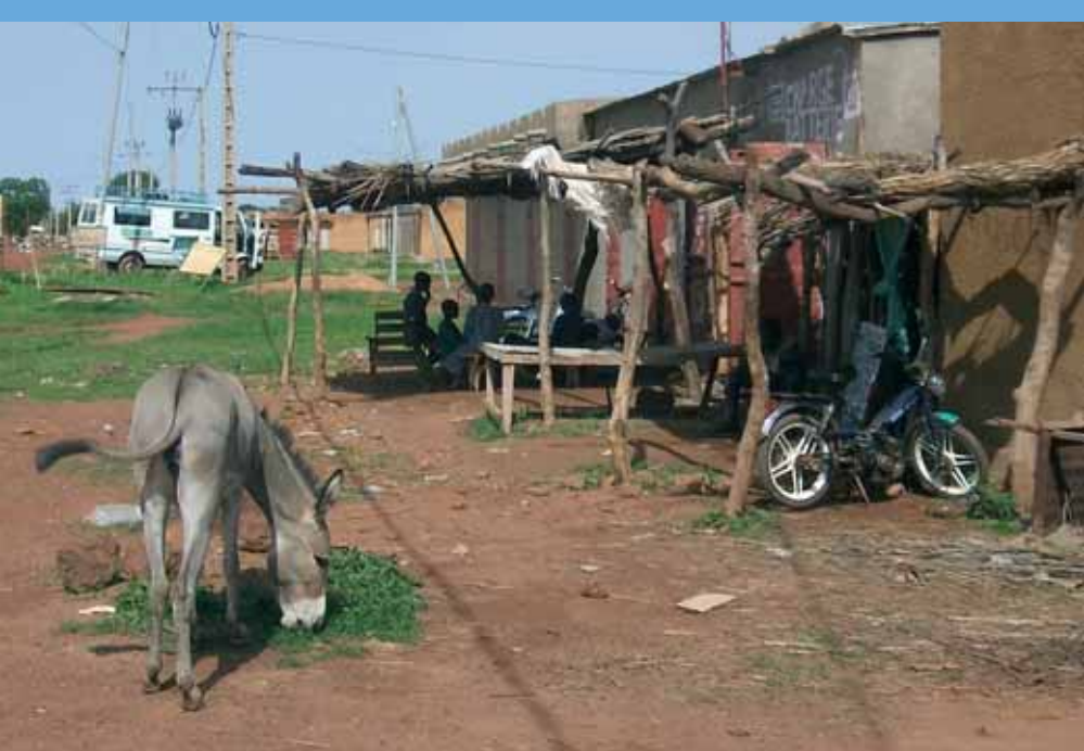
Local town in Sélingué, Mali