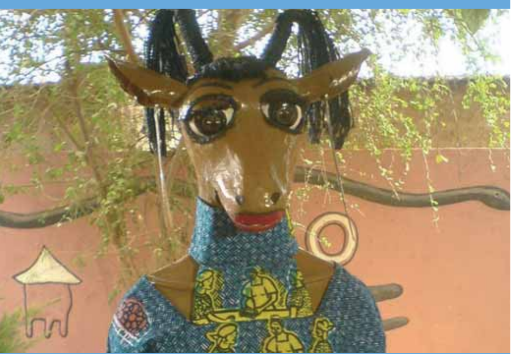
Chevrina the TV goat (IABER project), Burkina Faso