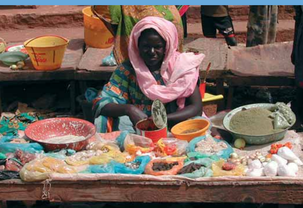
Market scene, Mali