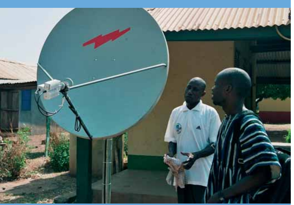
resting the sattelite dish for the SEND foundation, Ghana