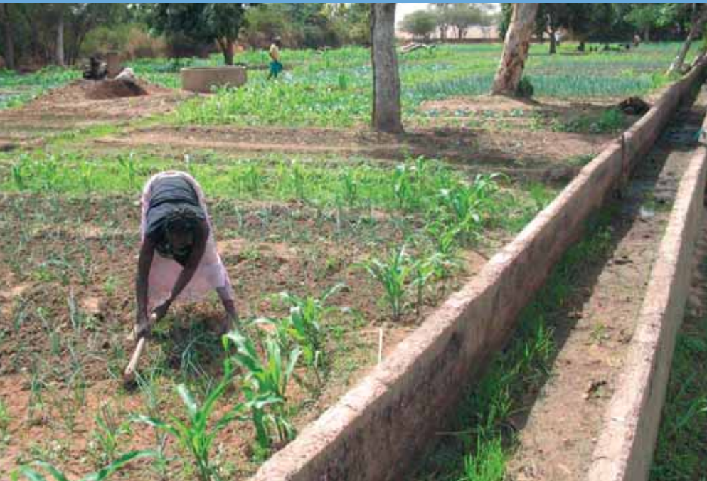
Tending to crops, Seguedin, Burkina Faso

In this programme, information on prices, availability, etc. is gathered at the farm level through hand-held computer devices, and the information is centralised in a national database. The information is then made available through a web portal and compiled into printed reports customised for each target group.