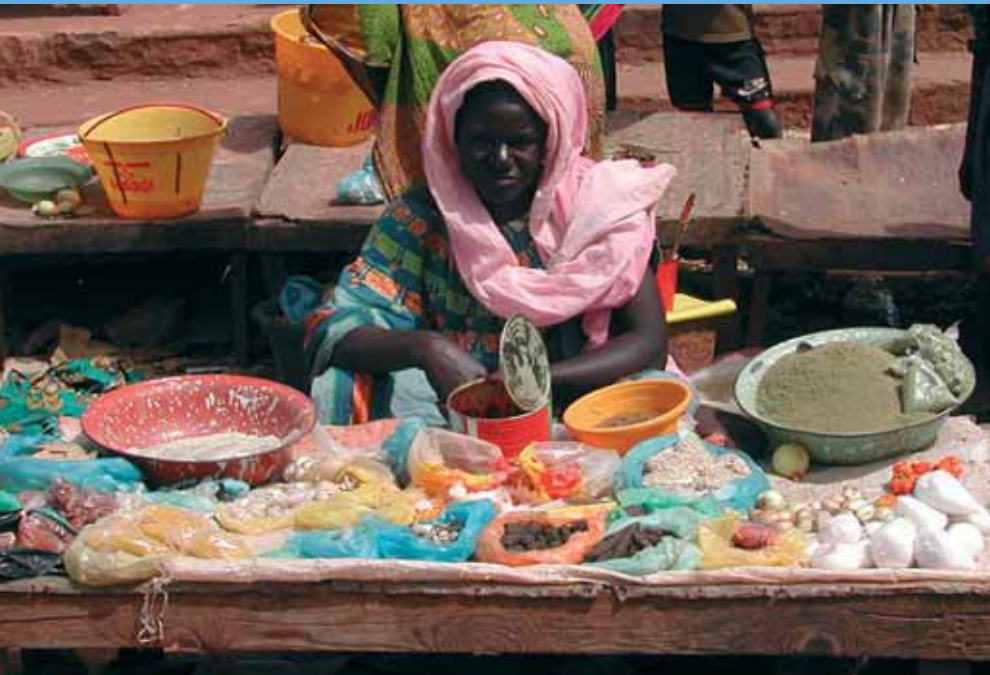
Market scene, Mali