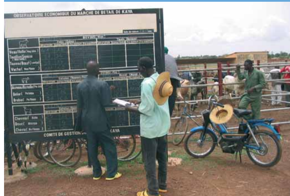
Pricing up for the cattle market, Kaya, Burkina Faso