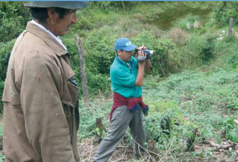
Documenting the AGRECOL project, Chapare, Bolivia