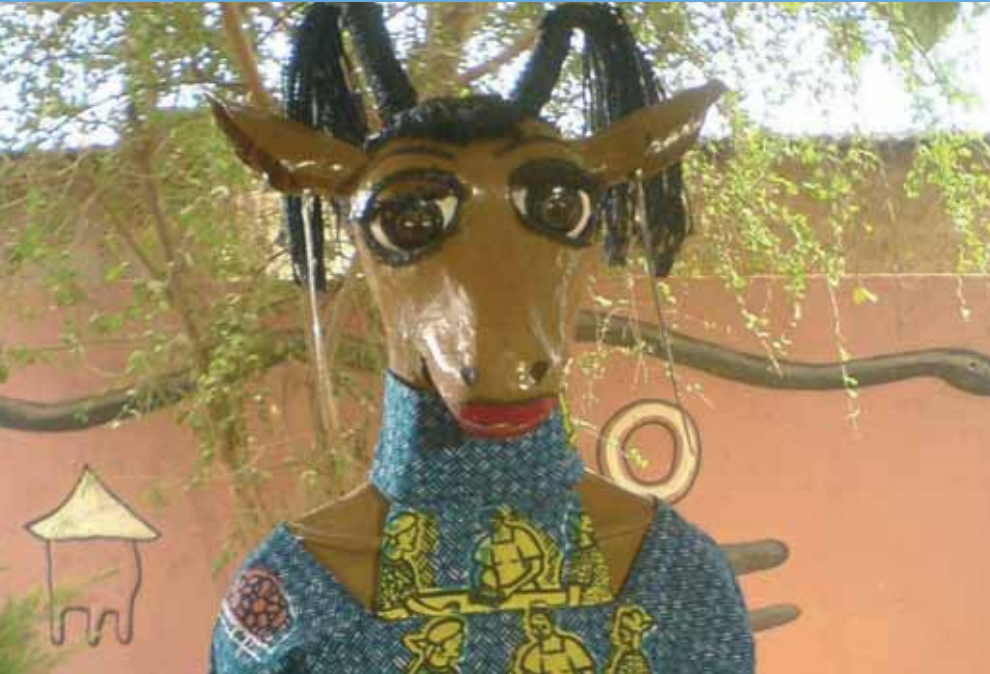
Chevrina the TV goat (IABER project), Burkina Faso