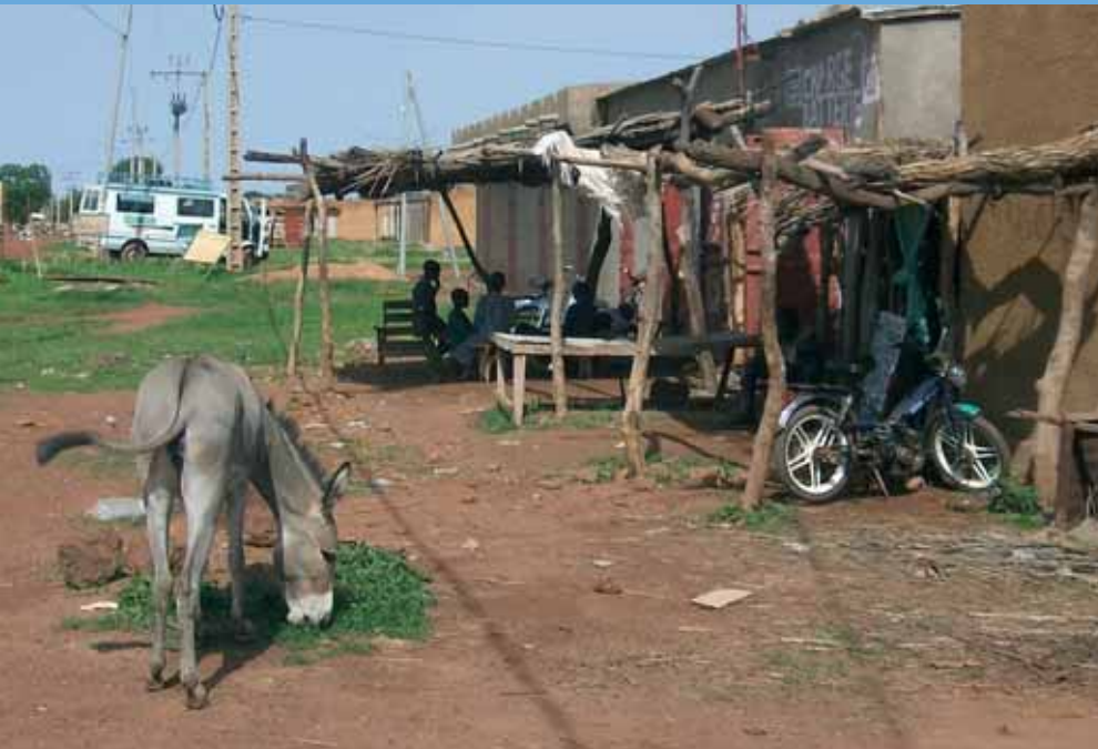
Local town in Sélingué, Mali