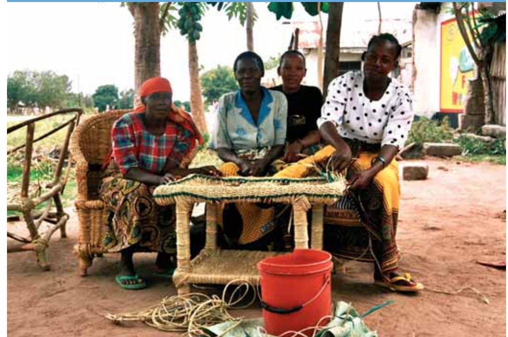
Local women making furniture, Magu, Tanzania