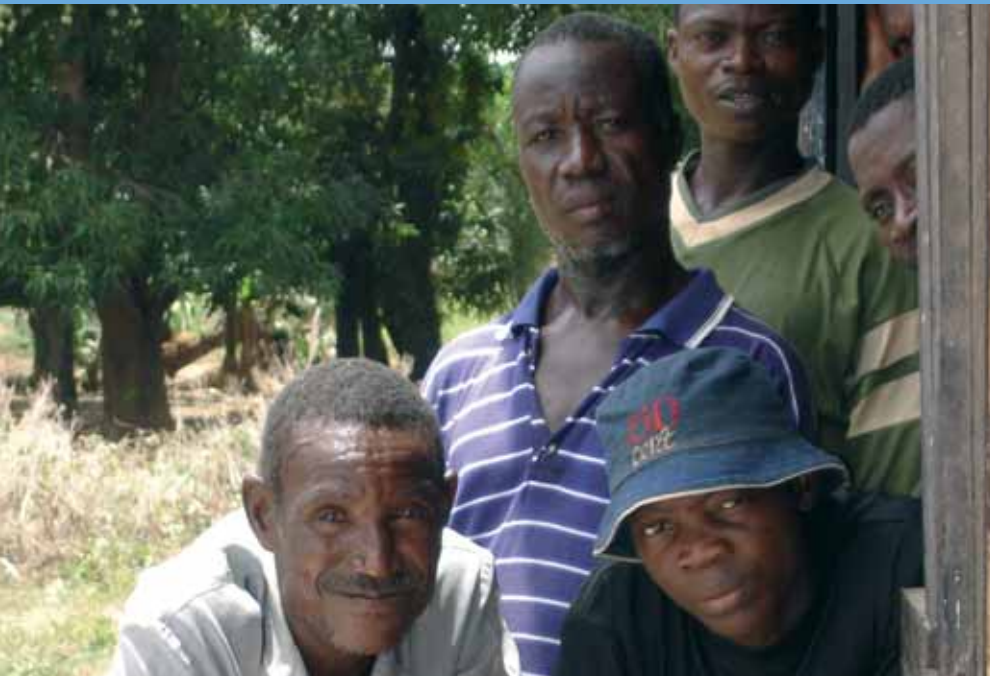
Farmers working with the SEND foundation, Salaga, Ghana